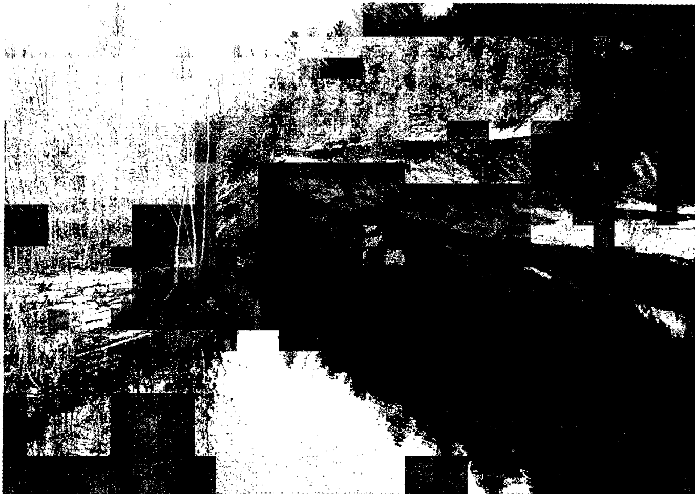
A marble quarry, once the economic foundation of West Rutland, is filled with water.